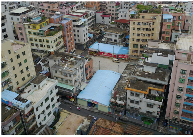
Figure 2. The built environment of the Nantou Old Town in 2016.