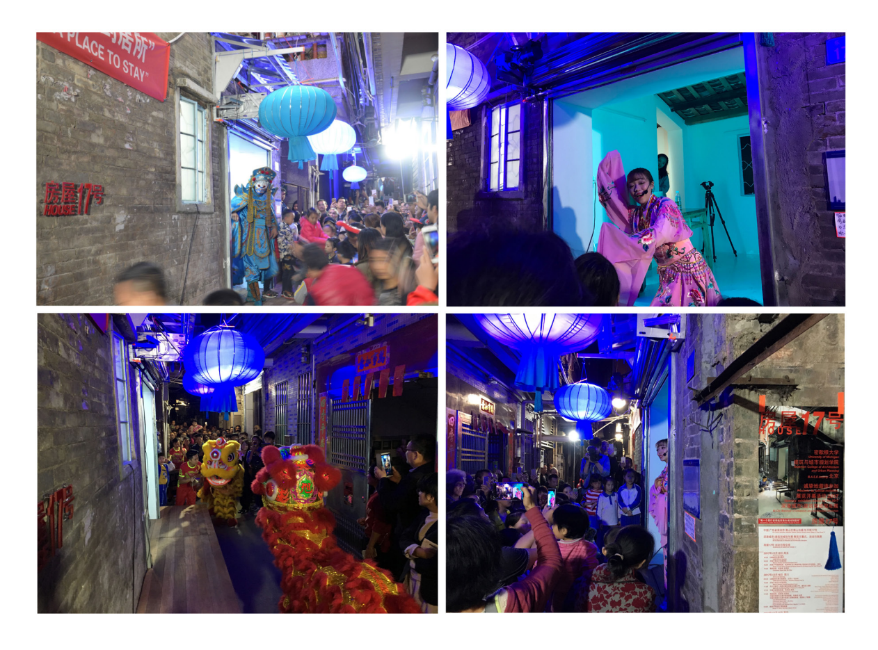
Figure 4. Performances by migrant artists occupying the House 17 during the biennial exhibition in Nantou.

social groups, such as the local farmers and migrant workers, were coined in this small old house.